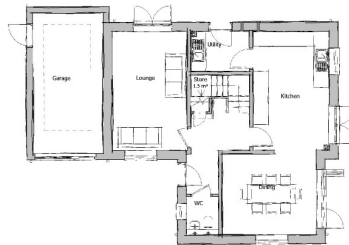
Ground Floor Plan 1: 100