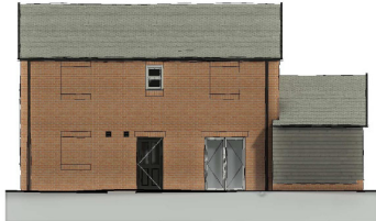
Side (West) Elevation 1: 100