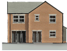
Rear Elevation (North) 1: 100