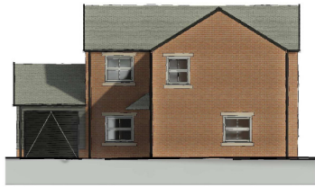
Side (East) Elevation 1: 100