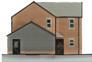
Front Elevation (South) 1: 100